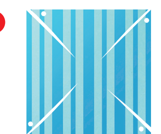
Use the hole punch to make holes in the corners as shown.